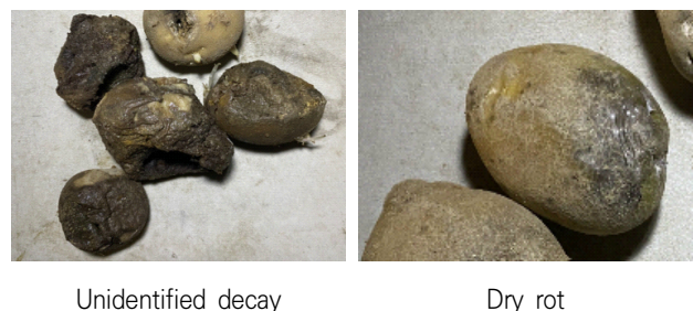
Fig. 3. Appearance of diseases on fresh potatoes stored in common warehouse at room temperature in summer season 2022.

incidence during two-month storage remained very low, with diseases mostly corresponding to dry rot along with some cases of rotten potatoes (Fig. 3). After two months of room temperature storage in the improved warehouse, disease incidences of 0.3%, 1.4%, and 0.8% were observed for Atlantic , Superior , and ChubaeK , respectively (Table 4). No diseases were observed for cold and semiunderground storage. Postharvest curing is the most basic and common treatment used to inhibit disease incidence during storage (Hide and Cayley, 1983; Hide and Cayley, 1987; Olsen et al., 2006; Voss et al., 2022). Although curing is generally performed at RH=85%-95%, the recommended temperatures vary between 12-15°C (Holcroft, 2018) and 15-18°C (Wang et al., 2020). The low disease incidence was attributed to the thorough curing in the dedicated curing room