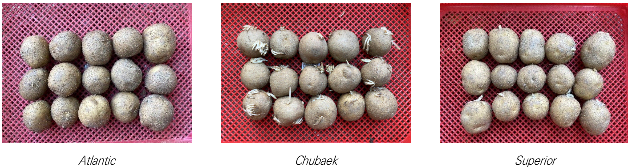
Fig. 2. Appearance of sprouting on fresh potatoes including Atlantic , ChubaeK , and Superior varieties after one month of storage in cave type warehouses.

ChubaeK and slowest for Atlantic . Generally, the dormancy period is 80-90 days for Atlantic and Superior and 60 days for ChubaeK (Kwon et al., 2005). Despite the curing period of 12 days, all three varieties showed sprouting within ~40 days of storage at room temperature. Atlantic and Superior were reported to require more than three months of storage at 5°C to begin sprouting (Choi et al., 1999), and no sprouting was observed during up to seven months of storage at 3.5°C (Leach, 1987). Herein, we observed sprouting in Superior within ~70 days after harvesting, i.e., after 12 days of curing and two months of storage at 4°C. The early sprouting observed for ChubaeK agrees with that observed for overmature tubers (Iritani and Sparks, 1985). Even considering the above, all three varieties featured very early sprouting times, which suggests that sprouting may have been accelerated by the extremely poor growing conditions during the later growth and harvest stages and the resulting maturity and quality degradation. However, the precise mechanism remains unclear because of the underexplored effects of reduced sunlight and soil waterlogging due to monsoon rains during cultivation on the sprouting of stored potatoes.